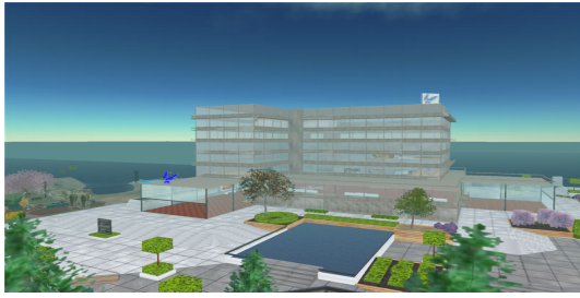
Fig 1. VU Campus – outside view

Two and a half months later, we are online, with a virtual campus, that contains a lecture room, a telehub from which teleports are possible to other places in the building, billboards containing snapshots of our university's website from which the visitors can access the actual website, as well as a botanical garden mimicking the VU Hortus, and even a white-walled experimentation room suggesting a 'real' scientific laboratory. All building and scripting were done by a group of four students, from all faculties involved, with a weekly walkthrough in our 'builders-meeting' to re-assess our goals and solve technical and design issues.