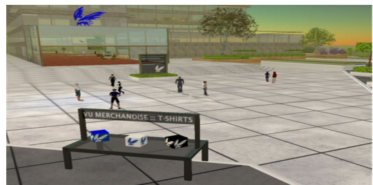
Fig 3. VU @ SL – visitors outside

Whether Second Life will turn out to be a veritable media-supported augmentation of our first life, cf. Zielinski (2006), remains to be seen. Chances are also that Second Life will end up as another item on the dead media projects 22 list, to be replaced by an alternative participatory framework or environment.