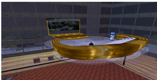
Fig 2. VU Campus – inside view

Two and a half months later, we are online, with a virtual campus, that contains a lecture room, a telehub from which teleports are possible to other places in the building, billboards containing snapshots of our university's website from which the visitors can access the actual website, as well as a botanical garden mimicking the VU Hortus, and even a white-walled experimentation room suggesting a 'real' scientific laboratory. All building and scripting were done by a group of four students, from all faculties involved, with a weekly walkthrough in our 'builders-meeting' to re-assess our goals and solve technical and design issues.